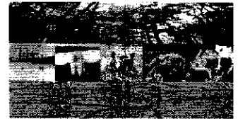
Biodiversity and Climate Change

22 May 2007 International Day for Biological Diversity